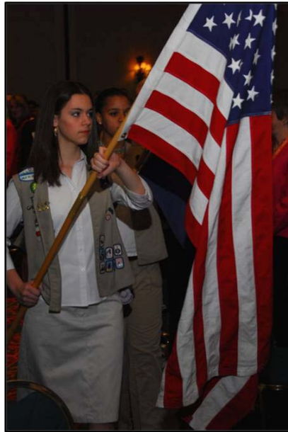
Girl Scouts present the colors during the opening of the NOHC.