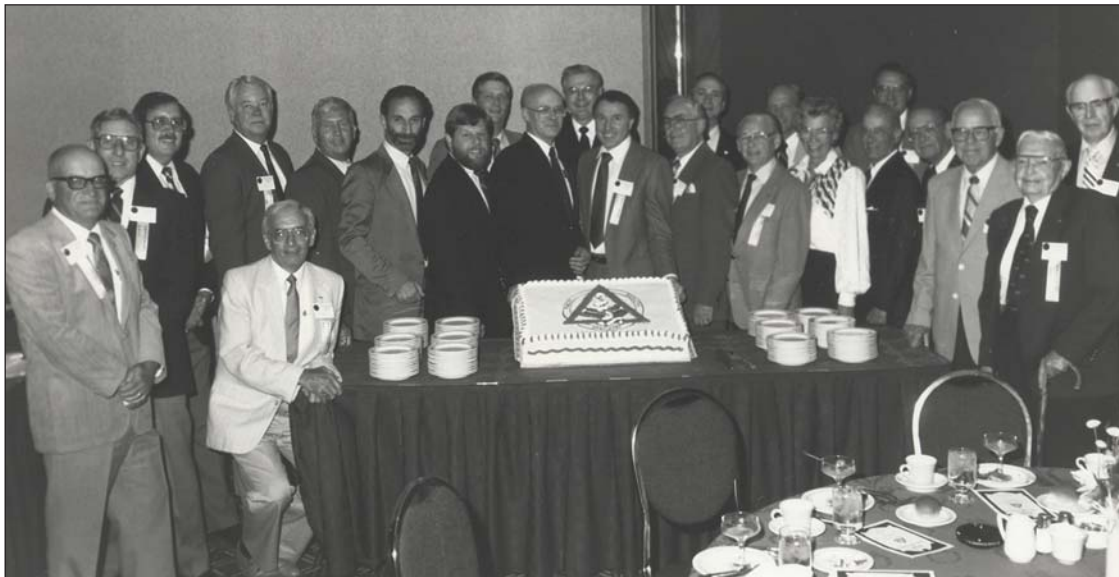
AAPHD Past Presidents at the AAPHD 50th Anniversary Celebration.

The biggest challenges for a non-profit organization are the 3 “Ts” – time, talent and treasure. We rely on our membership for their time, talent, and financial resources – all needed to keep up AAPHD’s increasing momentum.