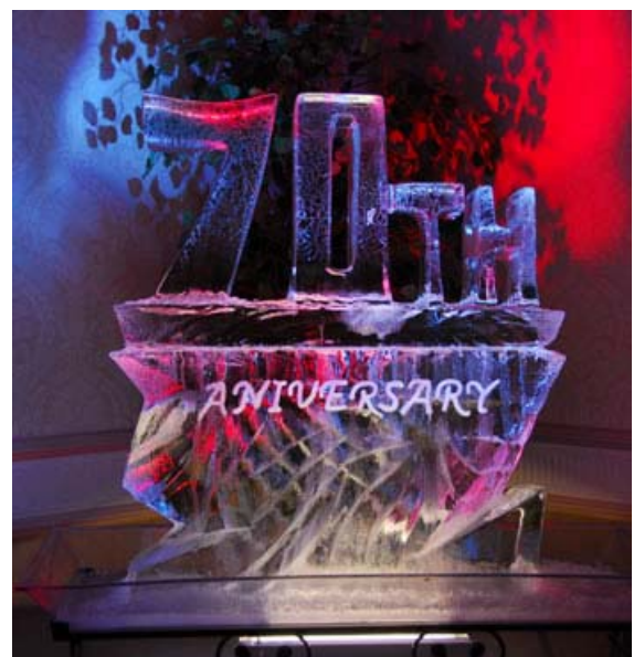
70 th Anniversary Ice Sculpture