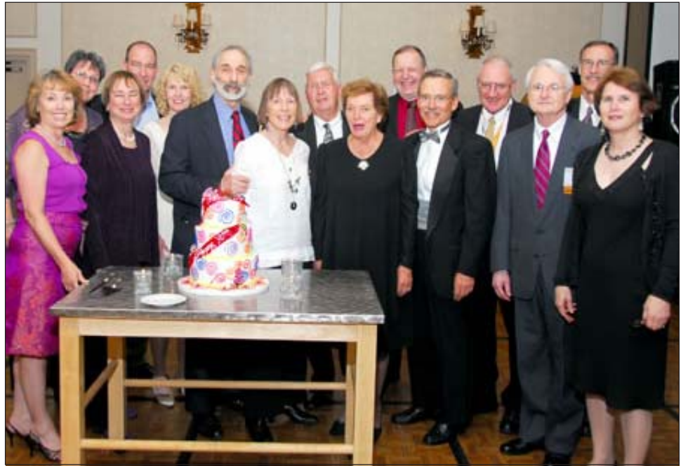
AAPHD Past Presidents gathered to celebrate the organization's 70 th anniversary.

In 1948, the dental directors felt the need for an organization devoted solely to their role as state dental directors and established the Association of State and Territorial Dental Directors (ASTDD).